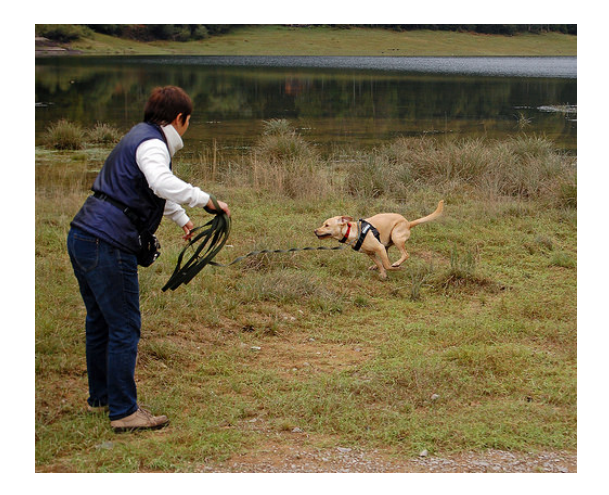
Figure 2: Image 117 was translated correctly as feminine "eine besitzerin steht still und ihr brauner hund rennt auf sie zu ." when not using the image features, but as masculine "ein besitzer …" when using them. The English text contains the word "her". The person in the image has short hair and is wearing pants.