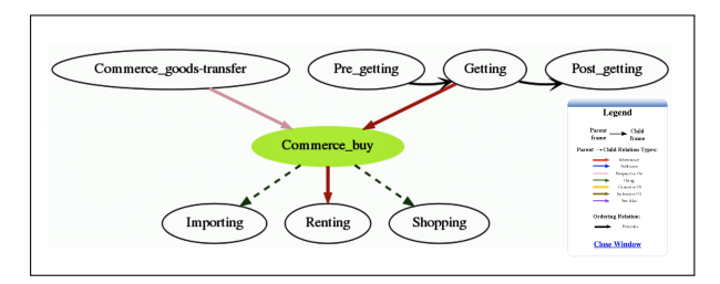
Figure 2: The FrameNet Commerce_buy frame and its immediate neighbors

bike' can trigger two frames: 'Claim_ownership' and 'Commerce_buy'. 2