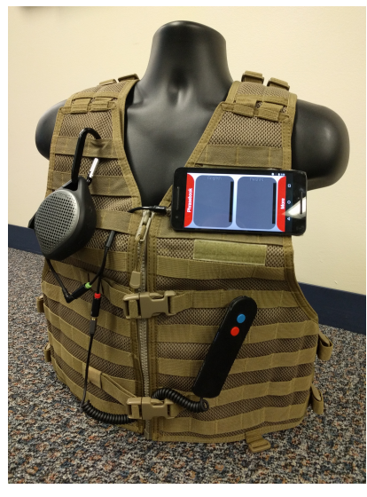
(a) S2S mounted on vest, including peripherals