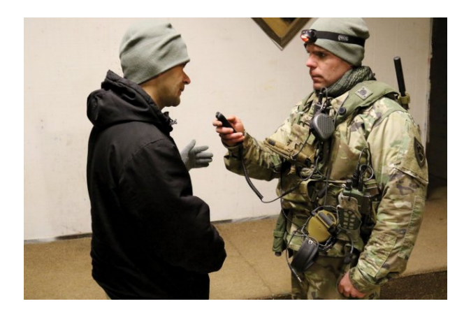
Figure 4: The application tested during a live exercise (AEWE)