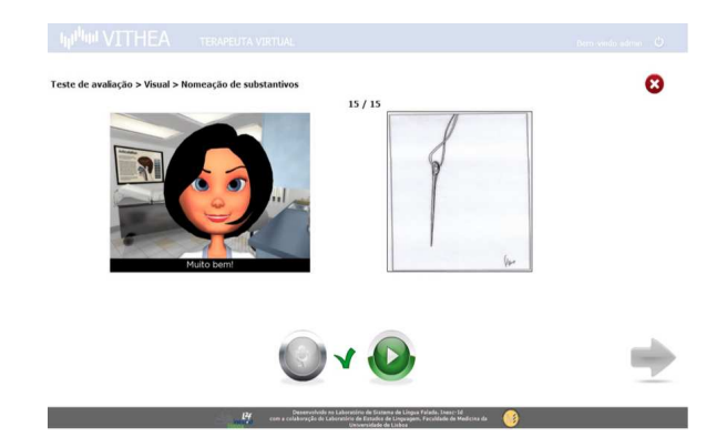
Figure 1: A caption of the VITHEA platform during the presentation of an exercise.

Extending VITHEA for including neuropsychological tests involved important alterations in the original platform, both on the patient and the clinician modules. However, the flexibility of VITHEA allows for the easy addition of new categories of exercises. These can then be combined in multiple ways by the clinician to form new tests, and to create different exercises of