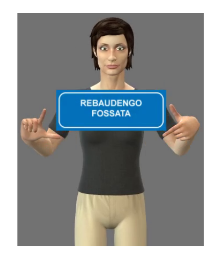
Figure 2: The sign for Rebaudengo Fossata , a less known station in Turin.

A prototype of the translator has been implemented in Clojure <sup>3</sup>, that is a functional program-