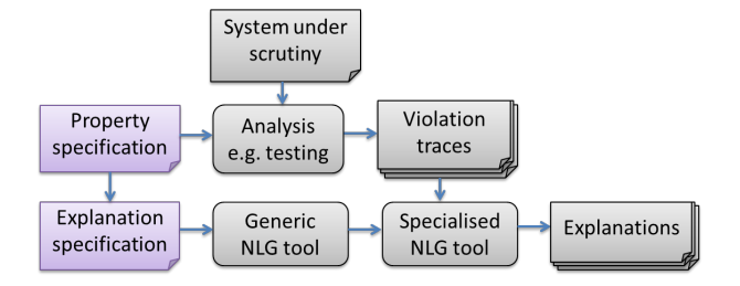
Figure 1: The architecture for general system diagnostics

Pace and Rosner (Pace and Rosner, 2014), showed how a finite-state (FS) system can be used to generate effective natural language descriptions of behavioural traces. Starting from a particular property, they show how more natural and abstract explanations can be extracted from a system trace violating that property. However, the approach is manual and thus not very feasible for a quality assurance engineer. We show how their approach can be generalised to explain violations of general specifications. Since the explanation needs to be tailored for each particular property, we develop a general system, fitting as part of a verification flow as shown in Fig. 1. Typically, a quality assurance engineer is responsible for the top part of the diagram — giving a property specification which will be used by an analysis tool (testing, runtime verification, static analysis, etc) to try to identify violation traces. With our approach, another artefact