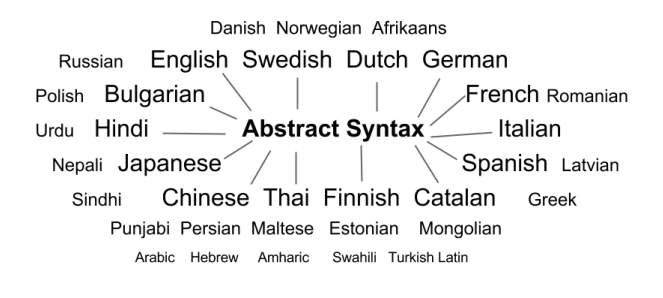
Figure 1: Languages in GF RGL.

The last item, conversions, guarantees that GF is not a closed world, but that GF grammars can be reused in other ecosystems. The advantage of GF is that it enables programming on a higher level than e.g. hand-written speech recognition grammars (Perera and Ranta, 2007). This is essential in order for grammar writing to be competitive with machine learning and statistics. Even in statistical systems, writing grammars can be a way to com-