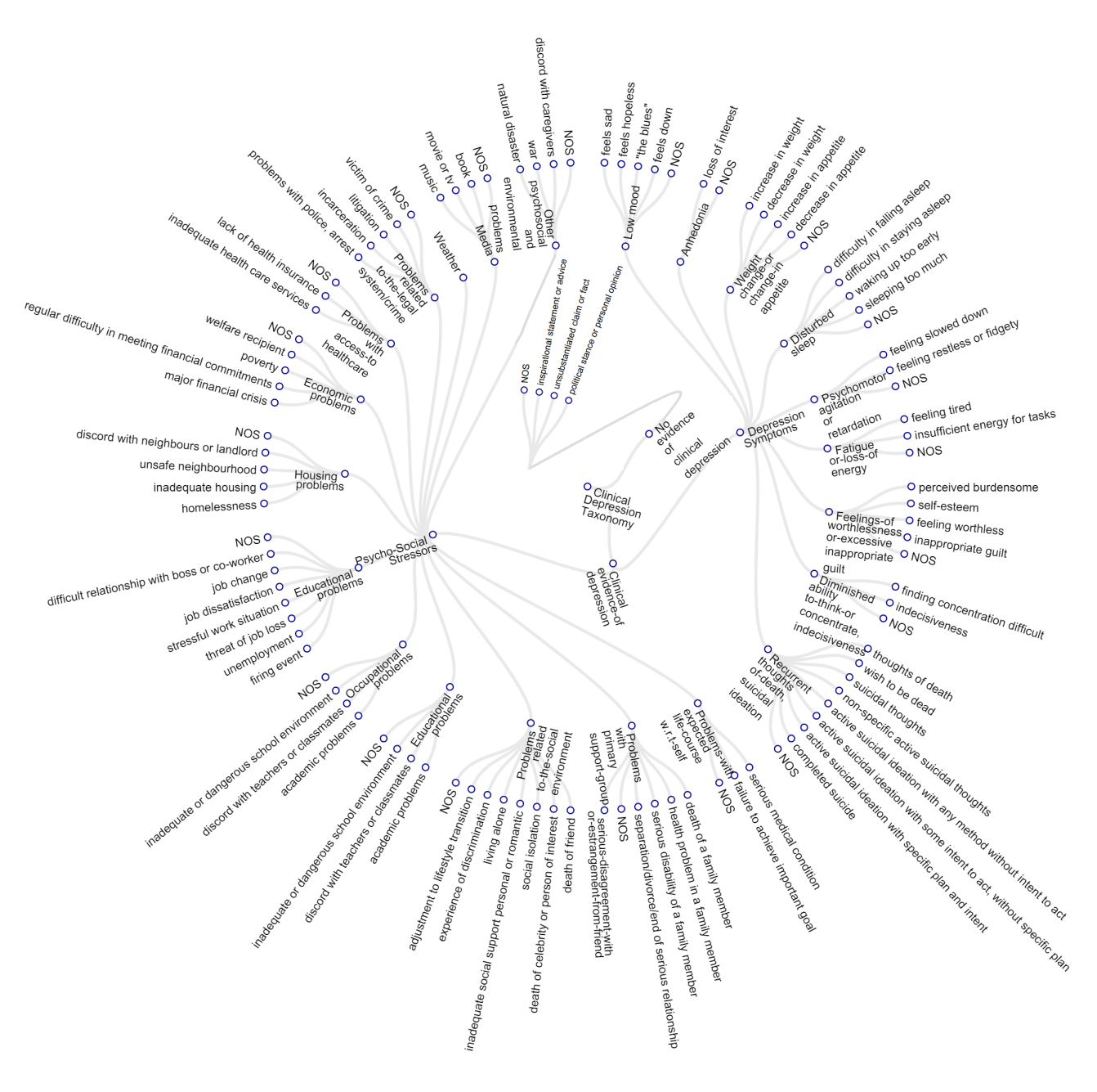
Figure 1: Radial representation of Depressive Disorder Annotation Scheme