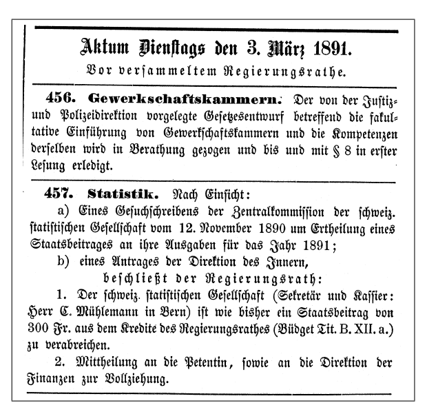
Figure 1: Detail of a session header, followed by two resolutions, in German. The numbered titles as well as Roman numerals are typeset in antiqua letters.

which already lead to a lower accuracy compared to antiqua texts – but also particular words, phrases and even whole paragraphs are printed in antiqua font (cf. figure 1). Although we are lucky to have an OCR engine capable of processing mixed Gothic and antiqua texts, the alternation of the two fonts still has an impairing effect on the text quality. Since the interspersed antiqua tokens can be very short (e. g. the abbreviation Dr.), their diverting script is sometimes not recognized by the engine. This leads to heavily misrecognized words due to the different shapes of the typefaces; for example antiqua Landrecht (Engl.: "citizenship") is rendered as completely illegible I>aii<lreclitt, which is clearly the result of using the inappropriate recognition algorithm for Gothic script.