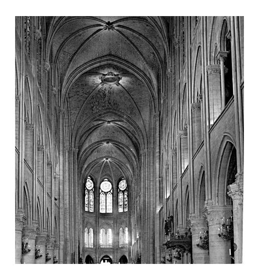
Figure 2: Nave of Notre Dame de Paris, showing the repetition of elements.

The outline of the ARC system is the result of close collaboration between architectural historians and artificial intelligence researchers. While the system is still in its infancy, the complete ARC system will have three distinct modes of interaction, to be used by three different types of user. We will refer to