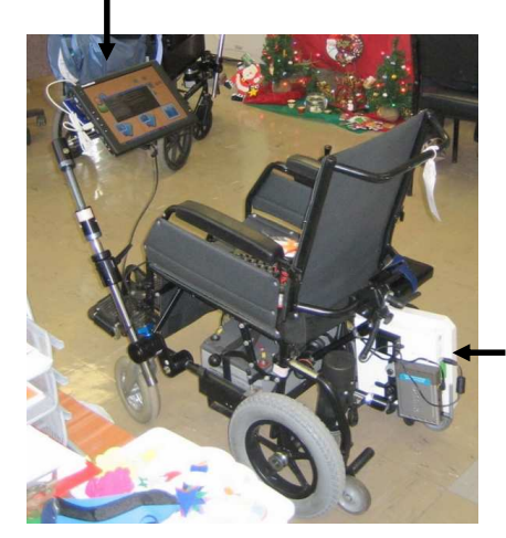
long range RFID sensor for location tracking

Tablet PC with NLG system and swipe-card RFID sensor