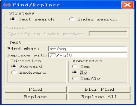
Fig.4 The tool of Find/Replace

There is the status bar in the bottom line of the word sense annotating interface, and there clearly show the annotating status: the total word occurrences, the serial number of the current processing instance and the number of the already annotated instances.