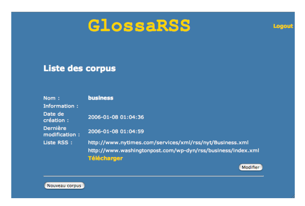
Figure 8. Online service for building RSS-based corpora

Linguists may find command line tools hard to use. For this reason, we have also developed a Web-based interface for facilitating RSS-based corpus development. GlossaRSS provides a simple Web interface in which users can create "corpus-acquisition tasks". They just choose a name for the corpus, provide a list of URL corresponding to RSS feeds and activate the download. The corpus will grow automatically over time and the user can at any moment log in to download the latest version of the corpus. For efficiency reasons, the download managing program checks that news feeds are downloaded only once. If several users require the same feed, it will be downloaded once and then appended to each corpus.