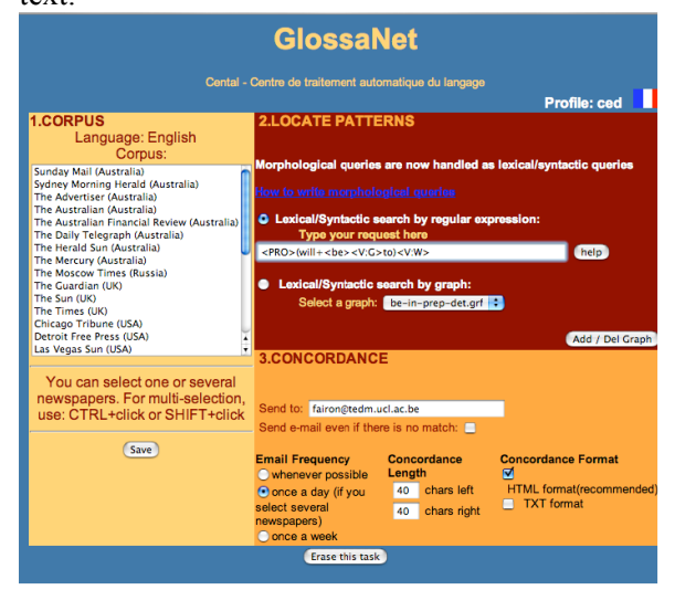
Figure 1. GlossaNet interface

process which ensures (a certain) quality of the text.