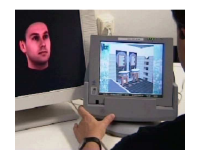
Figure 3: Interaction with the COMIC system.

lows real-time, three-dimensional exploring of the modeled bathroom. System output includes the application itself and a realistically animated, speaking head.