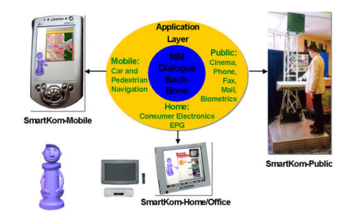
Figure 1: SMARTKOM's dialogue backbone and application scenarios

As it is depicted in Figure 1, SMARTKOM realizes a flexible and adaptive shell for multimodal dialogues and addresses three different application scenarios: