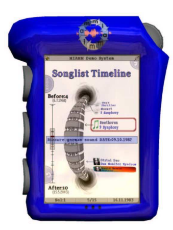
Figure 2: The force-feedback device developed in the MI-AMM project. The display shows a view of a database using a timeline.

the multimodal FUSION (see section 3.2) which is responsible for the resolution of multimodal references using the contextual information hold in the dialogue history, and the AP, that interprets the user intention and triggers a suitable system response. The AP is connected via a domain model to the multimedia database. The domain model uses an inference engine that facilitates access to the database.