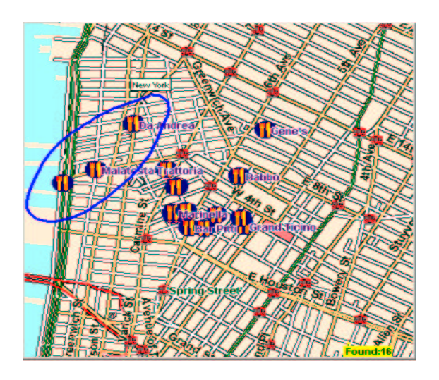
Figure 15: User circles subset for summary using a pen gesture.