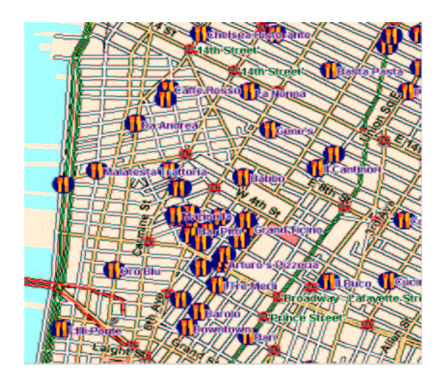
Figure 2: MATCH's graphical system response to Show me Italian Restaurants in the West Village .

makes it hard for the user to remember information relevant to making a decision. To reduce user memory load, we need alternative strategies to sequential presentation. In particular we require better algorithms for: (1) selecting the most relevant subset of options to mention, and (2) choosing what to say about them. We need methods to characterize the general properties of returned option sets, and to highlight the options and attributes that are most relevant to choosing between them.