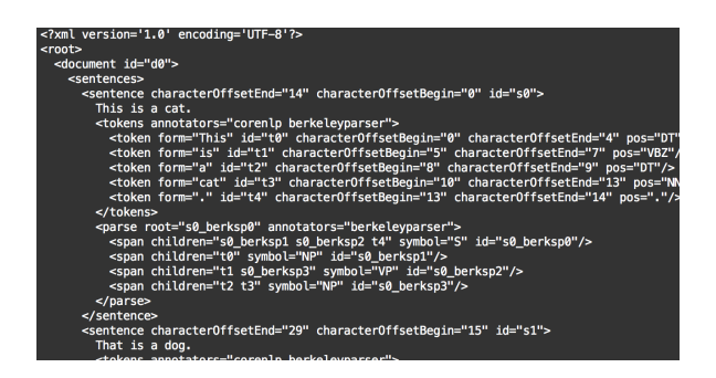
Figure 3: The output of the command in Figure 2 (sample.xml).

Figure 2: A command-line usage to run the Berkeley parser on sentences tokenized and splitted by Stanford CoreNLP.