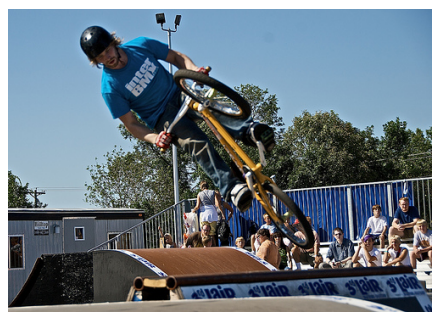
Candidate : A man is attempting a stunt with a bicycle.