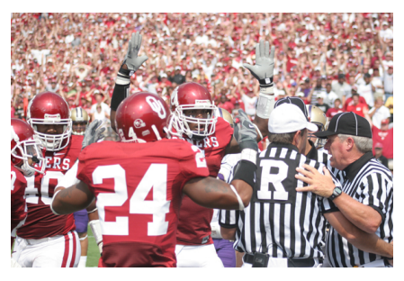
Candidate : Football players gathering to contest something to collaborating officials. Reference : A football player in red and white is holding both hands up. (a)