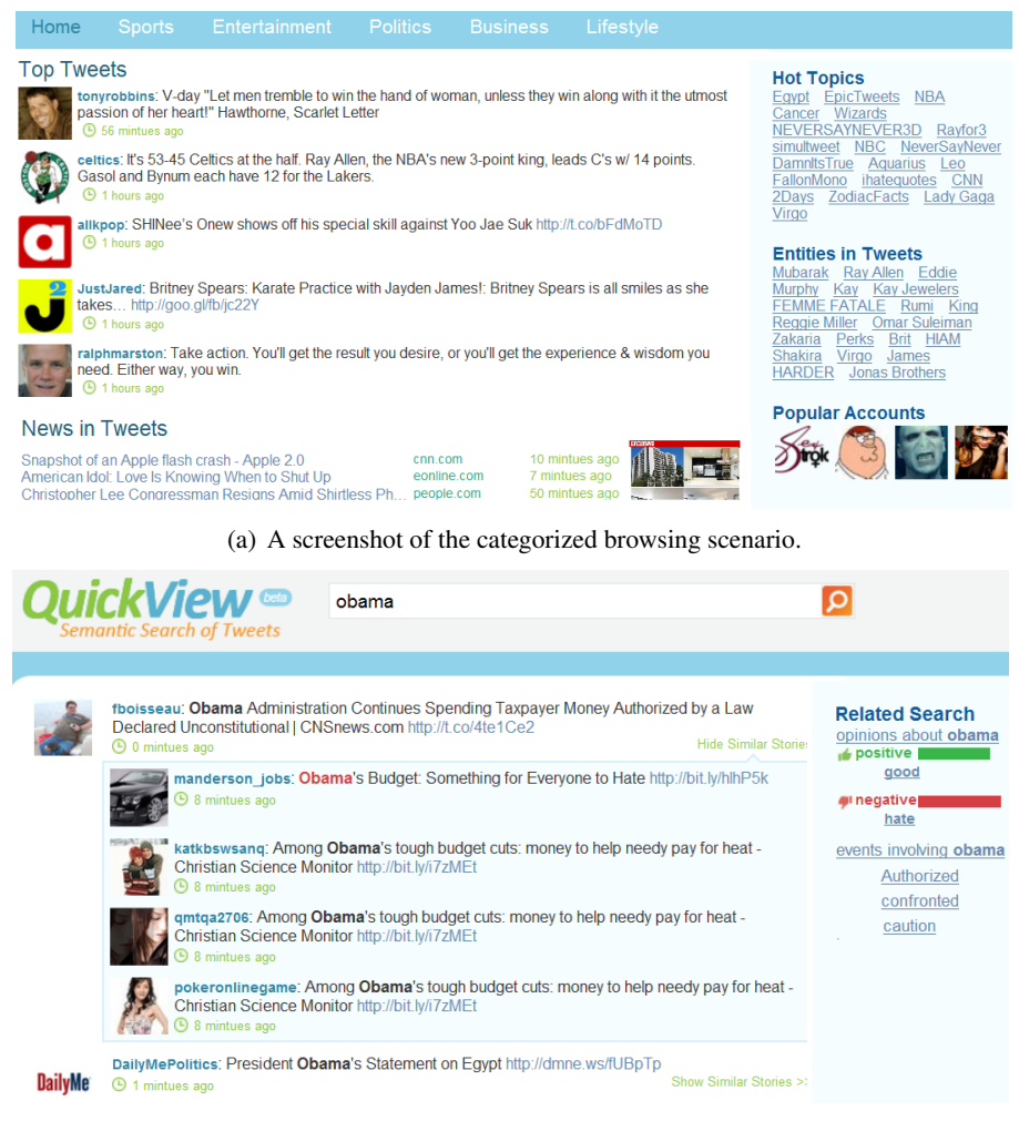
(b) A screenshot of the advanced search scenario.