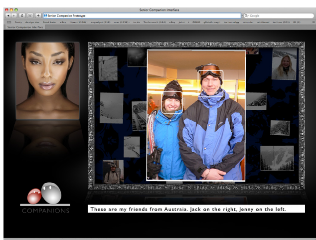
Figure 1: The Senior Companion Interface