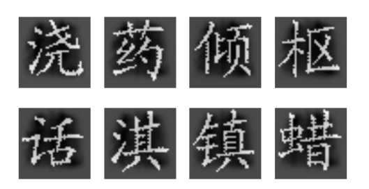
Figure 2: The pre-processed Chinese character images.

In all 66,856 words, we extract 5030 unique characters. We use a Chinese character image generation software to generate the images of these Chinese characters. We subtract a mean image from each input image to center it before feeding it into the CNN. The pre-processed Chinese character images are shown in Figure 2.