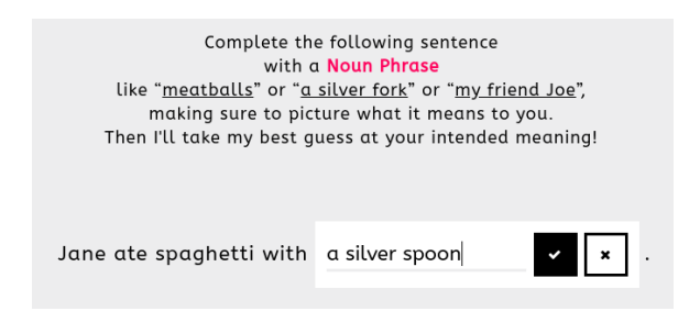
Figure 4: The main screen of the game, where users are asked to complete the ambiguous sentence in a way that the system will misinterpret.