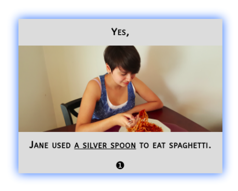
(scroll left or right for more options)