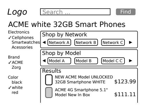
Figure 1: Example of a browse page.

The browse pages are linked among each other and can be organized in a hierarchy. This structure