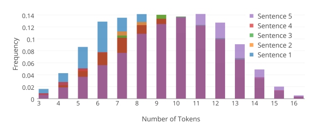
Figure 2: Number of tokens in each sentence position.

sentence is longer, providing more detailed conclusions to the story. Table 2 summarizes the statistics of our crowdsourcing effort. Figure 3 shows the distribution of the most frequent 50 events in the corpus. Here we count event as any hyponym of 'event' or 'process' in WordNet (Miller., 1995). The top two events, 'go' and 'get', each comprise less than 2% of all the events, which illustrates the rich diversity of the corpus.