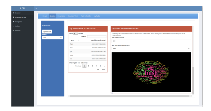
Figure 4: LCM Context Volatility Results. Screenshot of context volatility visualization.

Co-occurrence Analysis: For the identification of semantic correlations, the statistical significance of word co-occurrences is decisive in addition to their frequency. We integrate several ways to compute the statistical significance of the co-occurrence of tokens within defined contextual units. Possible contextual units are sentences, paragraphs or documents. Furthermore, it is possible to extract co-occurrences from contextual windows (e.g. n-left and n-right) and to analyse the ordering of the co-occurring words in the contextual units.