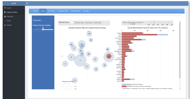
Figure 5: LCM Topic Model Results. Screenshot of a topic model visualization.

Manual Annotation: Manual methods of qualitative data analysis usually work with categories. Those could be obtained inductively from the empirical material through reading and interpretation. More importantly, categories can be deductively guided and operationalized on the basis of existing theories (e.g. with the help of lists of terms, so-called dictionaries). This is supported by the definition of hierarchical category systems, encoding of entire documents or text segments with categories of the category system, measurement of intercoder matches and administration and export of the manually coded data. Due to the browser-based user interface, several annotators can simul-