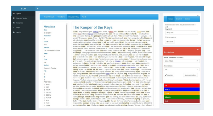
Figure 2: LCM Web Application. Screenshot of user interface (document view).

A screenshot of an early GUI-design is given in Figure 2. It shows the full-text of a retrieved document together with its metadata and some analysis results (keyword highlighting and named entity annotations).