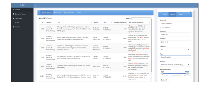
Figure 3: LCM Document Search. Screenshot of the document search interface.

Linguistic (pre-)processing: For most text mining applications, text data must be transformed into a numeric representation. For instance, word counts per document over the entire vocabulary can be represented as a vector. All document vectors of a collection together form a document-term matrix (DTM) on which various text statistical evaluations can be processed. To generate such a DTM representation