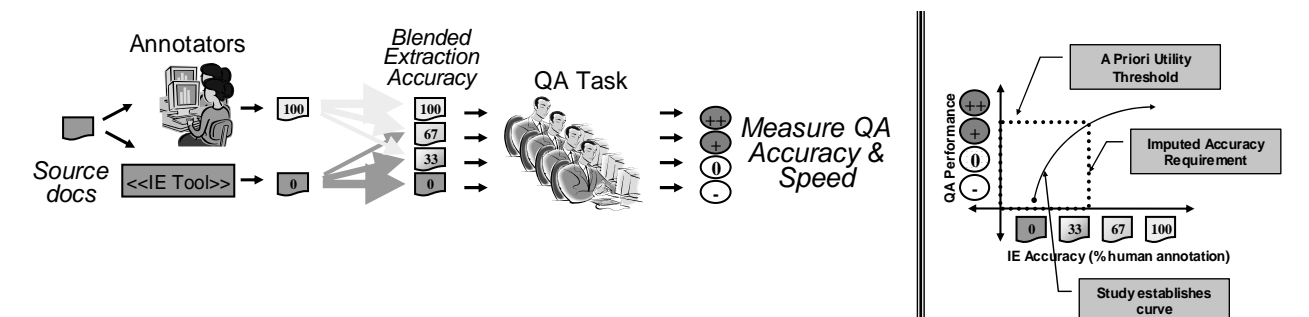
Figure 1: Study Overview

human performance. ACE Value Scores<sup>3</sup> were measured for each database. Pilot studies were conducted to develop questions for a QA task. Each participant answered four sets of questions, each with a different extraction database representing a different level of IE accuracy. An answer capture tool recorded the time to answer each question and additional data to confirm that the participant followed the study protocol. The answers were then evaluated for accuracy and the relationship between QA performance and IE quality was established.