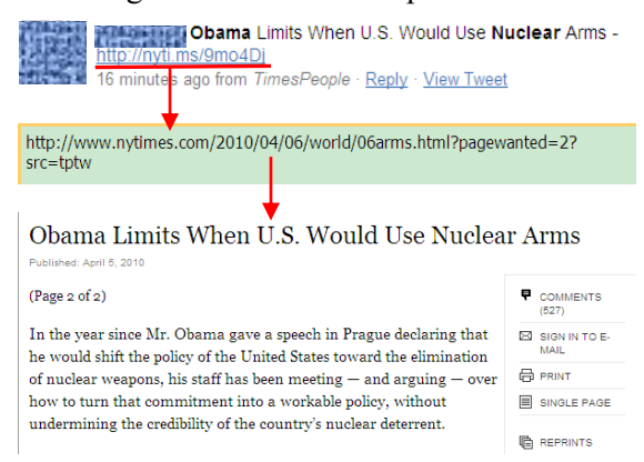
Figure 1. An illustration of news excerpt identification.

Given a tweet, to apply this rule, we first extract the content link and expand it, if any, into the full link with the unshorten service<sup>3</sup>. This step is necessary because content link in tweet is usually shortened to reduce the total amount of characters. Next, we check if the full link points to any of the pre-defined news sites, which, in our experiments, are 57 English news websites. If yes, we download the web page and check if it exactly contains the text content of the input tweet. Figure 1 illustrates this process.