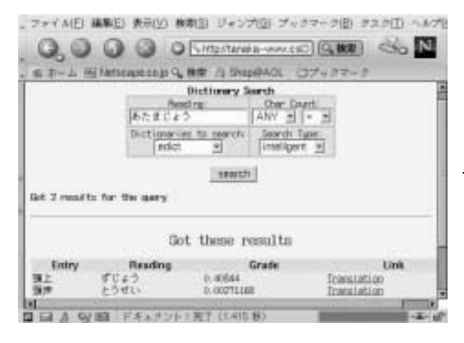
Figure 1: Example of system display

Breen (2000)) over the original dictionary, taking both kanji and kana as query strings and displaying the resulting entries with their reading and translation. It also supports wild character and specified character length searches. These functions enable lookup of novel kanji combinations as long as at least one kanji is known and can be input into the dictionary interface.