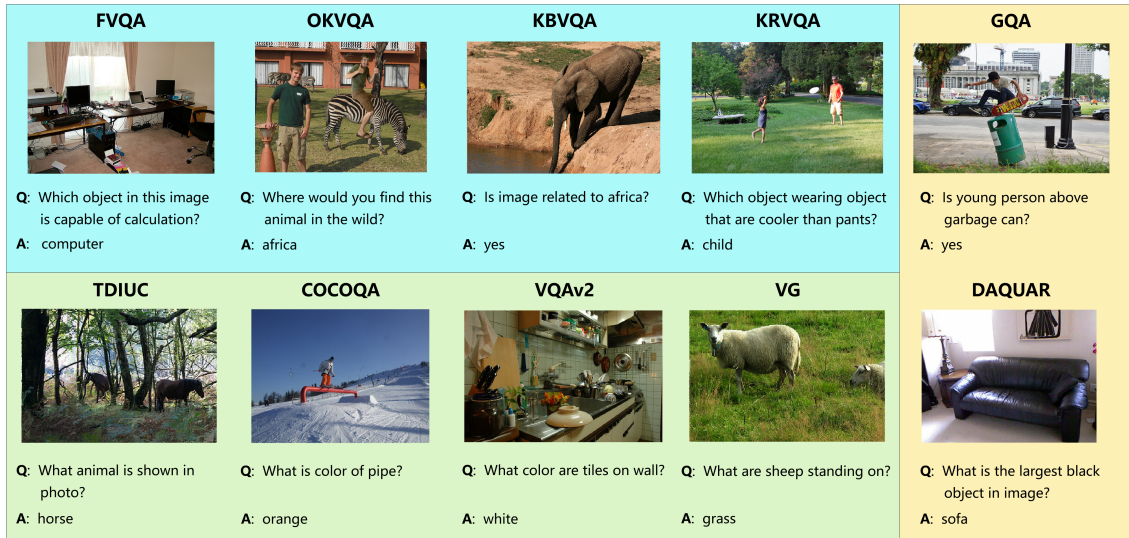
Figure 2: Examples of the ten VQA datasets. Different colors stand for different focus of VQA abilities. Blue for Knowledge Capability, green for Visual Attribute Recognition, and yellow for Scene Comprehension. The styles of these datasets and their motivation make it easy to cluster.

benefit from (but not solely relied on) the same corresponding VQA ability. Note that these abilities are not completely independent from each other. For example, to apply knowledge, basic recognition ability is indispensable.