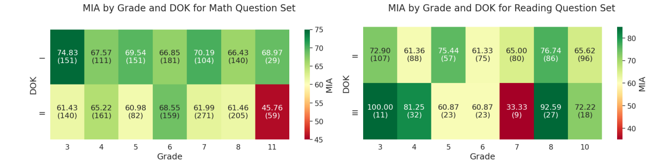
Figure 1: An illustration of MIA performance across different Grades and DOK levels for Math and Reading question sets. The top number represents MIA performance and the bottom number represents question counts. DOK I and II are selected for Math and DOK II and III for Reading. (best viewed in colors).