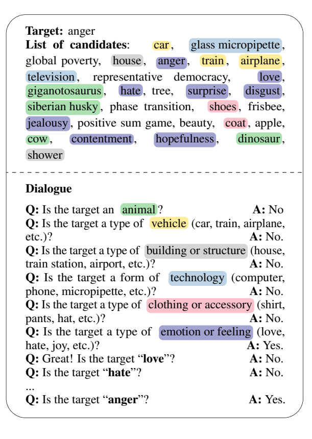
Figure 2: Example from the BigBench. DPO asks grounded CS questions (highlighted with colors), identifying the subset of the target (e.g., emotions). It then asks a series of HS questions.