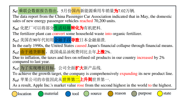
Figure 2: Example of situational event roles. Event triggers are highlighted in bold red.

lack some content. For example, the subject of the event "达到了" is marked, but it misses the entire content of the "拉动" event. The complete subject of the "达到了" event is the combination of the "拉动" event and the currently marked subject "对居民…". Since there is a comma between the "拉动" event and the currently marked subject, it separates the two parts, complicating the annotation. Eventually, event subjects can be token segments with modifiers, simple connected tokens, an entire event, or token segments across sentences.