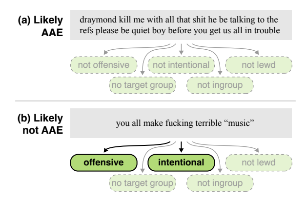
Figure 1: Two texts from the corpus of Sap et al. (2020), showcasing some of the five social bias aspects tackled in this paper: Neither text is lewd , talks about some target group , or is from an ingroup member. Unlike (a), however, (b) is offensive and intentional . While (a) contains elements common in AAE, i.e., the habitual be and dropped copula (Ziems et al., 2022), (b) does not.

A specific fairness issue arises when a bias detection model is predominantly trained and evaluated on standard language but applied to texts with dialect (Jurgens et al., 2017). Dialects appear in regional and social communities and introduce syntactic and lexical variations (Blodgett et al., 2016). As such, dialects may notably diverge from the source language, posing a challenge to models trained primarily on standard language (Belinkov