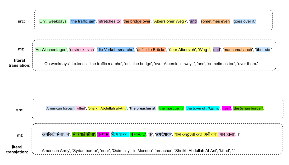
Figure 1: Illustration of chunk similarity for two example sentences (en-de & en-hi).

evaluates a machine translated output based on the corresponding source sentence regardless of the reference. Figure 2 depicts the high-level architecture of our model. The chunks of source and hypothesis are acquired from the multilingual chunking model. Further chunk-wise subword contextual BERT embeddings are mean-pooled to obtain the chunk-level embeddings. Meanwhile, LaBSE model (Feng et al., 2020) is used for the sentence-level embeddings. Using these embeddings, we compute chunk-level similarity and sentence-level similarity, finally combine them by averaging chunk- and sentence-level similarity scores<sup>1</sup>. We discuss the working details of our system in the following sections.