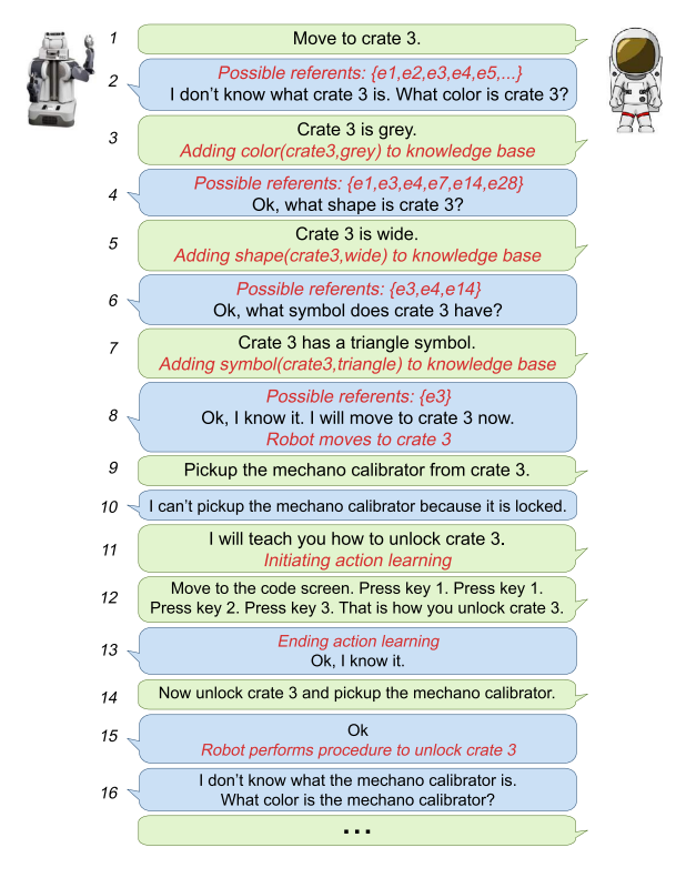
Figure 1: Example dialogue between a human and our system situated in an unexplored spacecraft environment, where the robot must learn new locations, objects, and actions through interaction with the human. The system's behavior is indicated in red.

<sup>1</sup>The term 'concept' in this paper refers to any entity in the task domain, including objects, locations, and actions.