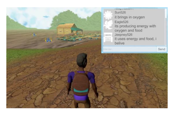
Figure 1: ECOJOURNEYS collaborative game-based learning environment and its in-game chat interface.

ECOJOURNEYS is a collaborative game-based learning environment for middle school science education focused on ecosystems (Mott et al., 2019; Saleh et al., 2019) (Figure 1). Students visit a virtual island in the game-based learning environment and are tasked with determining what is causing a mysterious illness among the island's fish population. Students work in groups of four to solve the mystery within the game, where each student works on a different laptop and interacts