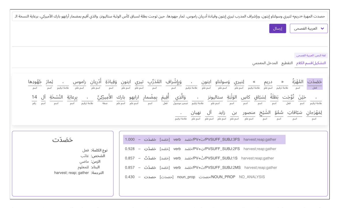
Figure 2: The Camelira interface presenting the same example in Figure 1 using the Arabic user interface.