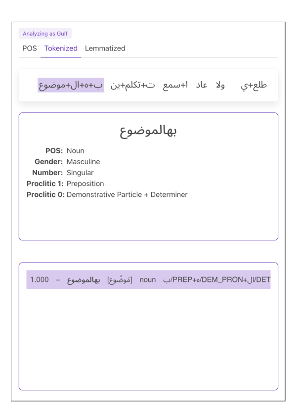
Figure 5: The Camelira interface with a Gulf example sentence: "Go up to your room, I don't want to hear you talking about this subject again." In this example, the user specified the input dialect as Gulf.

Muhammad Abdul-Mageed, Chiyu Zhang, AbdelRahim Elmadany, Houda Bouamor, and Nizar Habash. 2021. NADI 2021: The second nuanced Arabic dialect identification shared task. In Proceedings of the Sixth Ara-