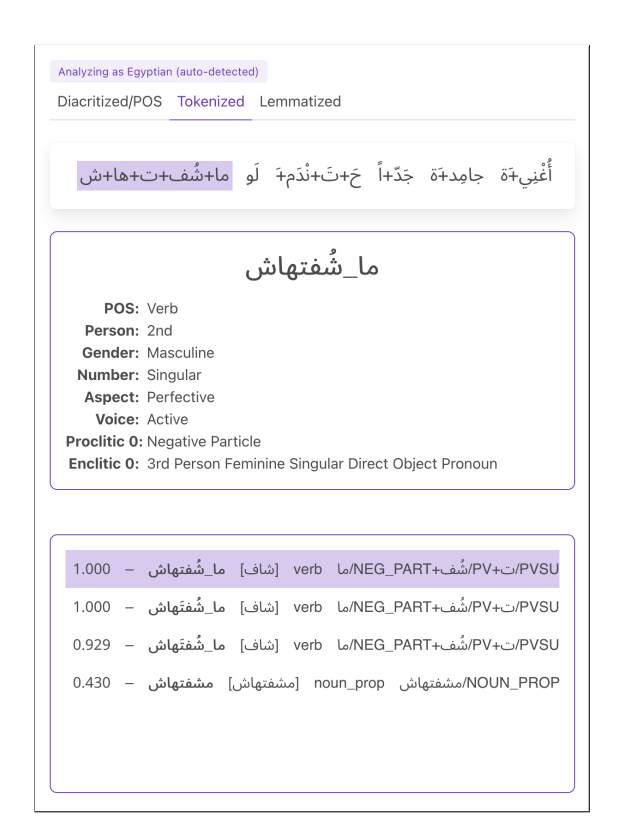
Figure 4: The Camelira interface with an Egyptian example sentence: "A very cool song [video clip], you'll regret it if you don't watch it." In this example, the input text is automatically correctly detected as Egyptian.