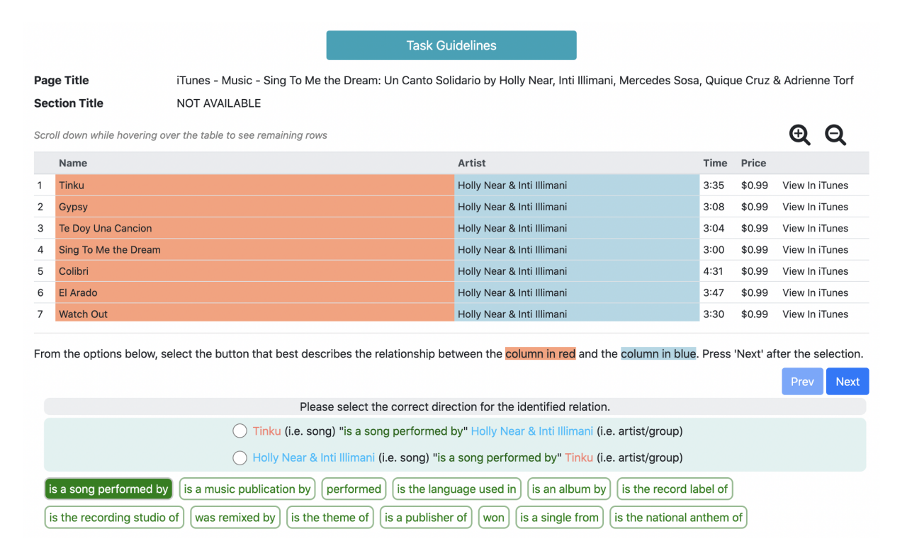
Figure 2: The annotation user interface for creating REDTab dataset. On top the 'Task Guidelines' are given. The 'Task Guidelines' is followed by page title, table title of the table, along with all the row values of table. A list of relations are provided, and upon selection of a relation (example shown 'is a song performed by'), the two options are provided showing the directionality of Subject column.