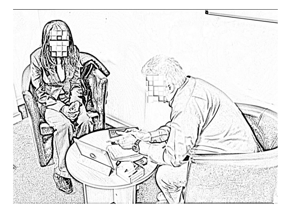
Figure 2: C Points to Screen with Left Hand

in overlap on line 4 and when she gets the floor in line 5-and reformulates her point about accommodation preceded by a small gesture for emphasis. C nods twice towards P to acknowledge the importance of P's reformulation which contains a significant complaint about being denied access to her possessions but then queries who "they" are, possibly thinking this could be a reference to family, which P answers in overlap ("housing"). At this point C is unable to integrate P's turns into his understanding of what is going on. He switches to a generic clarification question at line 8. In line 9, P repeats that she was locked out and after the truncated question in line 10 C clearly orients to P. P's gestures then become more emphatic, peaking at "things" and then reducing as C turns back to his notes.