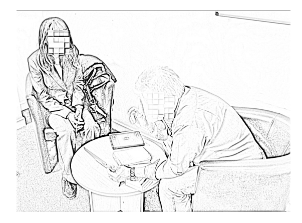
Figure 3: C Points Up 'Hold' Gesture, Right Hand