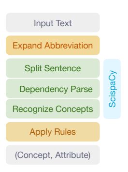
Figure 3: The pipeline of the fact extractor FACTEXT.

ROUGE First, we use the standard ROUGE scores (Lin, 2004), and report the F1 scores for ROUGE-1, ROUGE-2, and ROUGE-L, which compare the word-level unigram, bigram, and longest common sequence overlap between the generated