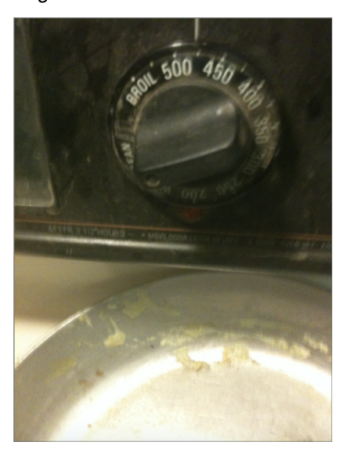
Annotators: 400, 550, 500, 475, 475, 475, 475, 500, 550, 500

What does the dial indicate as the top facing number?