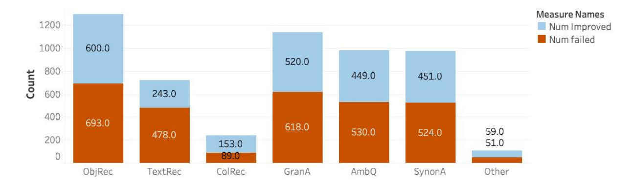
Figure 4: The performance improvements from MFB to ALBEF on the VizWiz dataset with respect to the reduced number of data examples with 0 accuracy score. Red color represents the number of data examples ALBEF got 0 score on while red plus blue color represents the number of data examples MFB got 0 score on – blue color thus represent the number of data examples improved by ALBEF from MFB. Note that we combine the challenge classes that has less than 50 data examples as "Other".

can bring insights for future work to improve accessibility VQA systems.