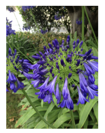
Annotators: flowers, flower, flowers, flowers, flowers, flowers, plants, flowers, flower, iris