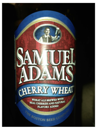
Annotators: samuel adams cherry wheat, beer, samuel adams cherry wheat ale, samuel adams cherry wheat ale, samuel adams cherry wheat, samuel adams cherry wheat beer, cherry wheat flavors beet, bee. samuel adams cherry wheat ale. samuel adams cherry wheat beer