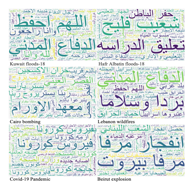
Figure 1: Word clouds showing the top 200 words from Kawārith for 6 selected crises