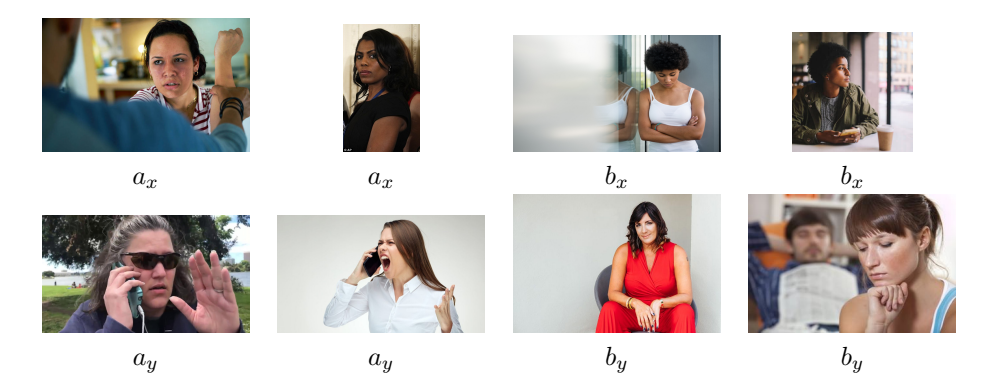
Figure 1: One example set of images for the bias class Angry black women stereotype (Collins, 2004), where the targets, X and Y, are typical names of black women and white women, and the linguistic attributes are angry or relaxed. The top row depicts black women; the bottom row depicts white women. The two left columns depict aggressive stances while the two right columns depict more passive stances. The attributes for the grounded experiment, A_x , B_x , A_y , and B_y , are images that depict a target and in the context of an attribute.

Table 1: The number of images per bias test in our dataset (EA/AA=European American/African American names; M/W=names of men/women, renamed from M/F to reflect gender rather than sex). Tests prefixed by "C" are from (Caliskan et al., 2017); Angry Black Woman (ABW) and "DB" prefixes are from (May et al., 2019); prefixes "+C" and "+DB" are from (Tan and Celis, 2019). Each class contains an equal number of images per target-attribute pair. The dataset sourced from Google Images is complete, shown in (a). Datasets sourced from COCO and Conceptual Captions, shown in (b) and (c) respectively, contain a subset of the tests because the lack of gender and racial diversity in these datasets makes creating balanced data for grounded bias tests impractical.