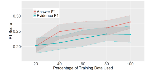
Figure 2: Learning curves showing Answer- F_1 and Evidence- F_1 on the dev. set while varying training data size.

Error analysis To gain insight into the model's errors, we sample 67 test questions with predicted Answer- F_1 scores below 0.10 from the LED model trained with evidence prediction scaffolding. We remove four cases in which the predicted answers are actually correct. Examining gold answers of the remaining 63, we find 31 are extractive, 24 are abstractive, 3 are "yes", 3 are "no," and 2 are unanswerable. We observe that LED often predicts shorter spans than the gold answers (9.5 words shorter than gold counterparts, on average). Focusing only on the 55 questions with either extractive or abstractive gold answers, we manually categorize error types in Table 5.