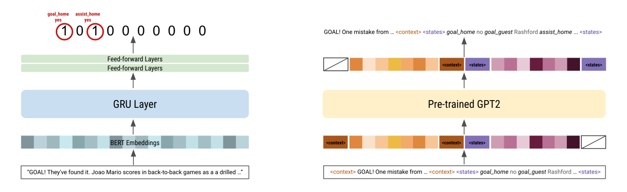
Figure 4: Model architecture of the GRU classifier and GPT-2 based variant.