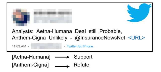
Figure 1: An example tweet from WT–WT dataset with different targets.

Over the recent years, several stance detection datasets have been proposed. These datasets, in turn, facilitated progress in stance detection research, with some systems achieving up to 93.7% accuracy (Dulhanty et al., 2019). However, most