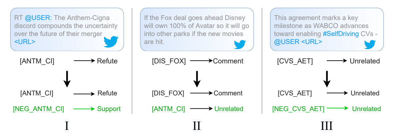
Figure 2: Procedure to create tWT-WT dataset from WT-WT.

between tweet and stance following the exact same procedure as (Gururangan et al., 2018) after removing stopwords. Table 4 shows that top 5 stance-wise words along with the fraction of tweets containing those words. We observer that certain groups of target-independent lexicons are highly correlated with stances in some cases occurring in more 29% of the tweet. For Support and Refute classes respectively, we find the co-occurrence of indicative words for the status of merger, such as 'approves' or 'blocks'. The Comments relating to these health companies' mergers often talk about its impact, leading to the choice of lexicons containing words like 'healthcare' and 'mean' with this stance. Similarly, Unrelated tweets often talk about things related to the companies but unrelated to the merger operation such as 'stocks' or 'bids'.