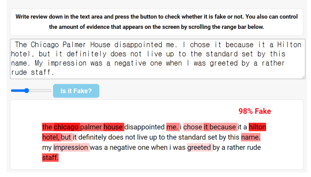
Figure 1: YONG - a prototype interface. Given the review input by user, YONG shows 1) whether it is gold or fake with 2) the probability (%), and 3) evidence that shows how much each word contributes to model's final decision. The highlighted evidences show the top p% proportion of the contributors, where the proportion can be adjusted using the horizontal slider bar.

(Devlin et al., 2018), fast and scalable anomaly detection algorithms like DenseAlert (Shin et al., 2017) have made effective and promising contributions in detection of fraudulent reviews. Despite such contributions, these approaches only focus on better modeling to improve the accuracy in fake review detection, instead of its practical applications such as assisting users to distinguish fake reviews (i.e., an assistance tool) or filtering out deceptive texts for review-based question answering (QA) (Gupta et al., 2019).