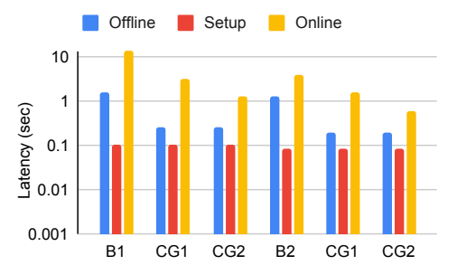
Figure 2: Latency comparison for two sets of experiments. "B1", the first "CG1", and the first "CG2" represents a model with the input size set at 10 and the hidden size set as 128. "B2", the second "CG1", and the second "CG2" represents a model with the input size set at 100 and the hidden size set as 64. "CG1" and "CG2" represents the CG-① and CG-② respectively. For both baseline cases, the online latency is significant. CG-① can reduce the online latency while maintains the same level of the offline and setup.

tion since the garbled circuits are sensitive to the bit length. Second, since these activation functions do not have any weight parameters, the overall accuracy of the neural networks with quantized activation functions can still hold. We summarize the results of testing CRYPTOGRU in Table 3 and we compare the latency shown in Figure 2. This benefit is further discussed in Section 4. We label this version as "CG-2" in all the following text.