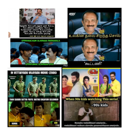
Figure 1: Sample memes from TamilMemes dataset with Latin transcripted or Tamil text

ages of memes, most which contained text embedded images.