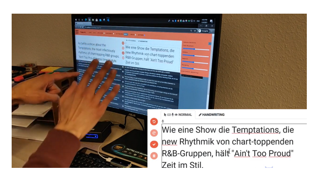
Figure 3: Mid-air gesture-based deletion by moving the right hand or finger up or down.

with a hand down movement. Thus, we implemented hand or finger movement down and up to offer consistent deletion possibilities (Figure 3). For D_s , it is sufficient if the cursor is placed somewhere on the word; there is no need to define the start and end of the word through a group selection.