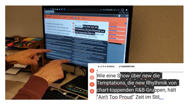
Figure 2: Mid-air gesture-based group selection by pointing with both indices.

with a hand down movement. Thus, we implemented hand or finger movement down and up to offer consistent deletion possibilities (Figure 3). For D_s , it is sufficient if the cursor is placed somewhere on the word; there is no need to define the start and end of the word through a group selection.