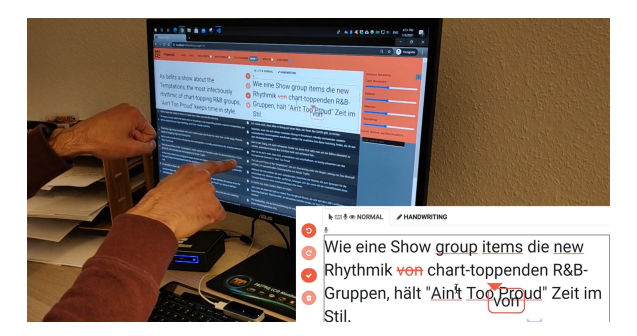
Figure 4: Mid-air gesture-based reordering by selecting, left grab, pointing with the right index finger to the target position, and releasing the grab.

For single item reordering, it is again sufficient to place the cursor on the item without selecting the whole text.