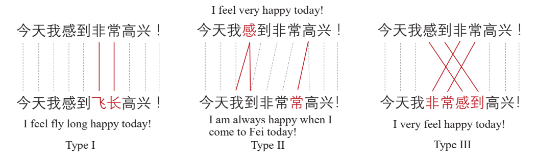
Figure 2: Illustration of the token information flows from the bottom tail to the up tail.

and Insertion . These two operations are used to handle the cases of word redundancies and omissions respectively. (3) Local paraphrasing . Sometimes, light operations such as substitution, deletion, and insertion cannot correct the errors directly, therefore, a slightly subsequence paraphrasing is required to reorder partial words of the sentence, the case is shown in Type III of Figure 1. Deletion, insertion, and local paraphrasing can be regarded as variable-length (VarLen) operations because they may change the sentence length.